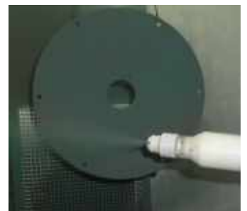
Flat pattern nozzle

Accessories: A set of different sized powder deflectors to create different sized powder clouds and the flat spray pattern (fan-pattern) generator nozzle – popular with many professional and industrial powder coaters. And, a number of spare cups for storing different colors.